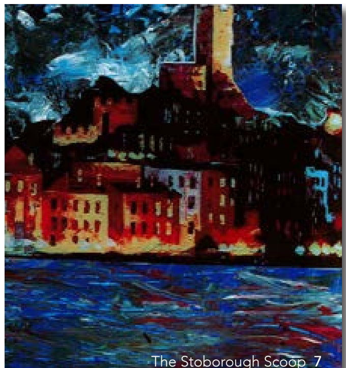
Venice Island painted using acrylics in the style of Leonid Afremov by Leon